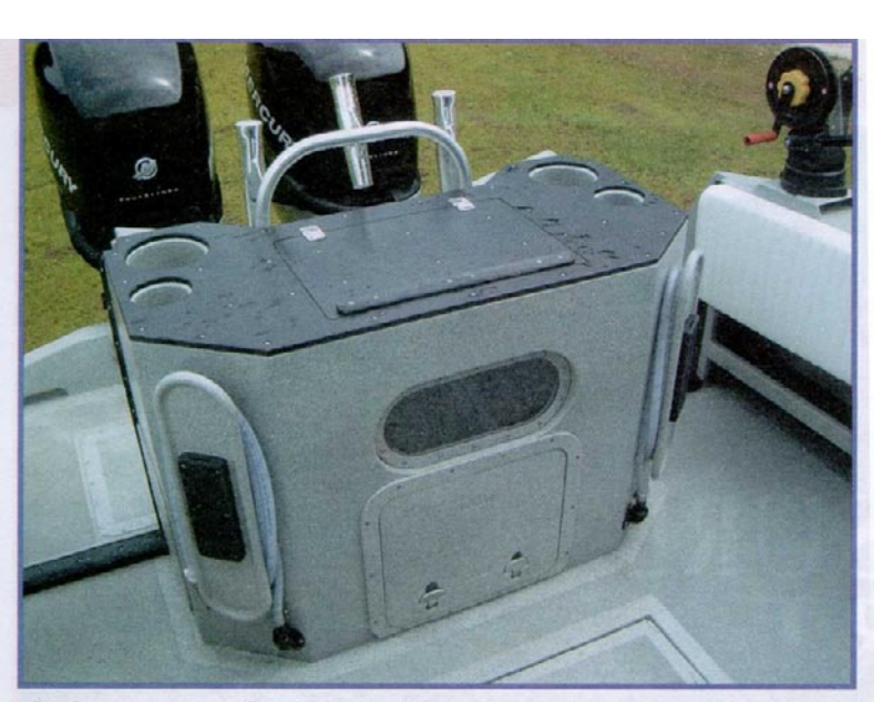
The bait center is flanked on either side by tuna doors leading to the swim platform where the engines are mounted.