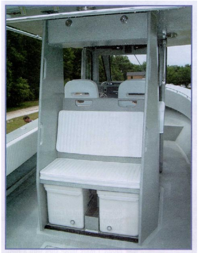
The rear facing seats have coolers mounted underneath them.

Woodham envisions 32-, 35- and 38-foot versions with outboard,