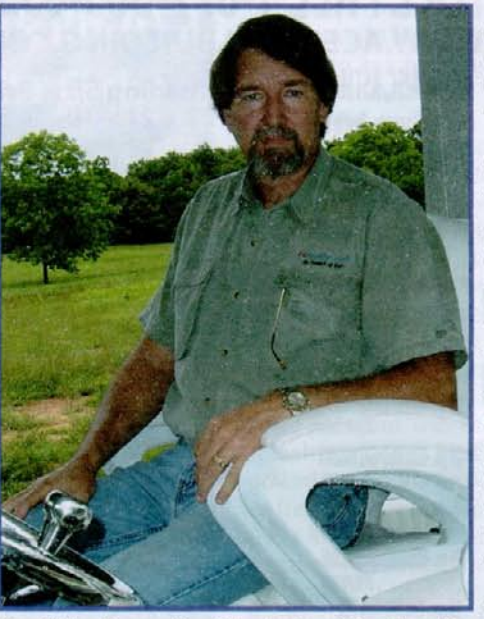
34 workhorse mackerel boat.

ed six combat cruises, sank 90,000 plus tons of Japanese shipping including an aircraft carrier, and was in Tokyo Bay for the surrender. Decommissioned in 1946, she was recommissioned in 1951 as an